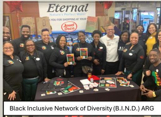
Black Inclusive Network of Diversity (B.I.N.D.) ARG