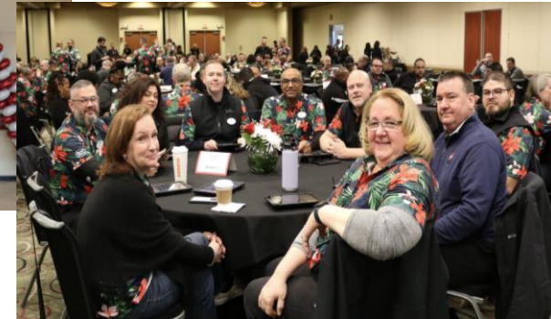
Vendor Buying Summit 2025 Tinley Park Convention Center