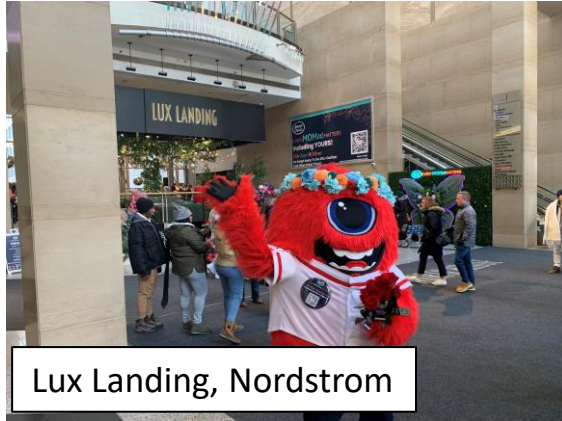
Lux Landing, Nordstrom