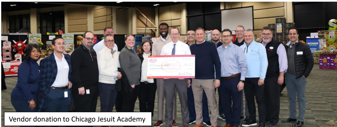
Vendor donation to Chicago Jesuit Academy