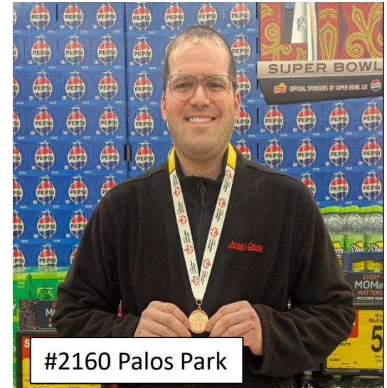
#2160 Palos Park